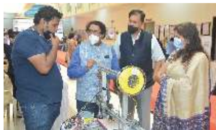
A Startup display during annual Startup Fest 2021

To give wings to the dreams of aspiring, young students with an entrepreneurial orientation, centres of excellence in the form of AIMA Biz Lab, Innovation Nxt lab, A.I. Lab have been established to strengthen the startup culture on the campus. Constituent units of SGI operate innovation and incubation cells and organize Start-up fests, learning sessions, design thinking workshops, Business idea competitions, IPR seminars, Hackathons and similar events to identify and nurture the entrepreneurial talent of SGI. Suryadatta also has institutionalised a tinkering lab for school students.