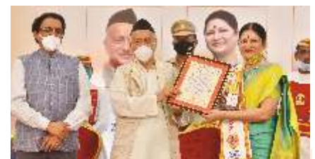
Key Suryadatta Stree-Shakti Puraskar Awardees

Suryadatta Stree Shakti Rashtriya Puraskar" are bestowed by Suryadatta Education Foundations Suryadatta Group of Institutes every year, at the hands of eminent & exemplary stalwarts. On Sunday, 27th June 2021, these awards were given at Rajbhavan, Mumbai in the hands of Hon'ble Shri. Bhagat Singh Koshyari - Governor of Maharashtra