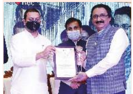
Most Innovative UG/PG College of Maharashtra in Emerging Sector Award at the hands of Hon'ble Shri. Amit Deshmukh, Cabinet Minister for Medical Education & Cultural Affairs

The vibrant industry - institute interface of SGI adds immense value to the academic programs through a series of industry visits, seminars, webinars, guest lectures, study tours, live projects, panel discussions and student chapters. Eminent industry professionals are members of the advisory board of SGI. They interact with and guide students on a regular basis. As an expression of our commitment to continuing education & upgradation of industry professionals, SGI offers sponsorship to over hundred corporate employees for pursuing post graduate Pune university courses since last over 9 years.