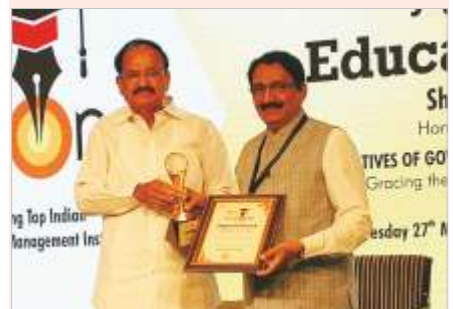
Suryadatta Institutes of Management are Ranked in "A" category & conferred with Top Institutes in Western India during 2019 at the Hands of H.E. Shri. Venkaiah Naidu, Hon'ble Vice President of India